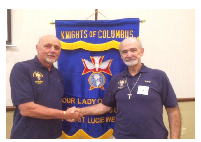
CHANGING OF THE GUARD